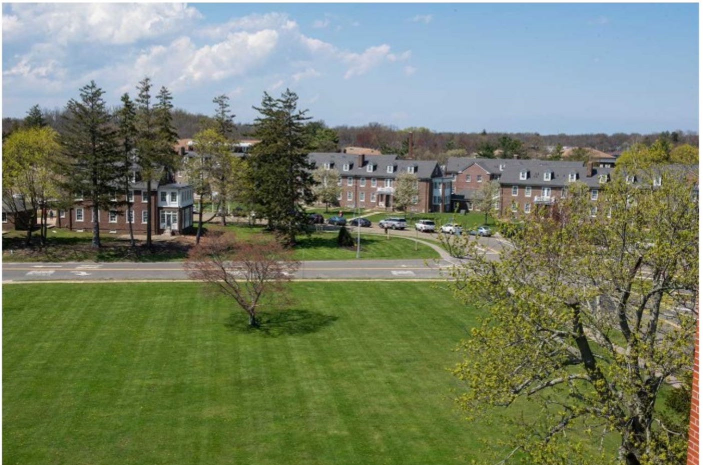
East Gate, Fort Monmouth.

By Heather Dean Bennington - May 25, 2018