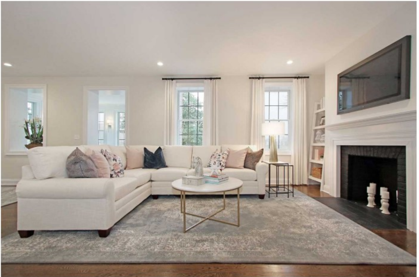
Living room in the newly completed homes.

RPM Development has launched sales at East Gate, a community featuring townhomes, duplexes, and single-family residences on the former 1,126-acre Fort Monmouth. The homes were created in century-old buildings where officers once lived. RPM took advantage of the early 20th-century building exteriors while creating modern interiors, for a twist of historic charm. Occupancy is scheduled for this August, and the 68 homes range in price from the high-$400,000s to the mid-$700,000s.